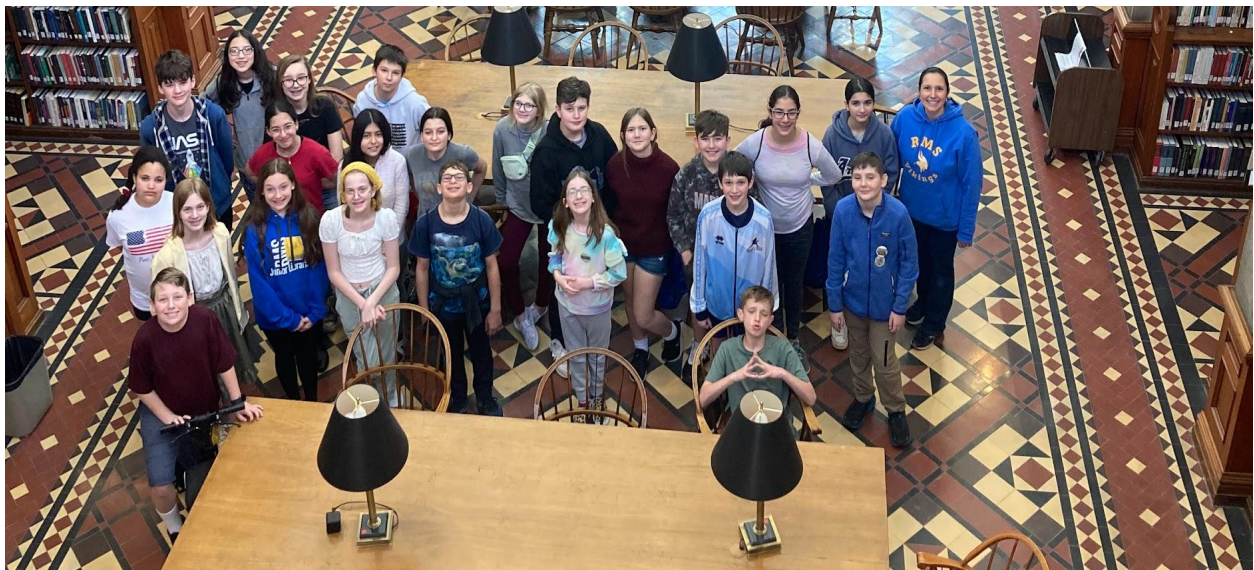
Junior Librarian field trip to Rutgers University/New Brunswick Theological Seminary

Join our Google Classroom (classroom code: wtnyou7) for the permission slip.